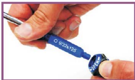
Simply twist/release to change out sizes

DY89320046 - 12 Piece Metric - 4mm, 5mm, 6mm, 7mm, 8mm, 9mm, 10mm, 11mm, 12mm, 13mm Quick change Ergonomic handle and custom roll-up velcro lock pouch