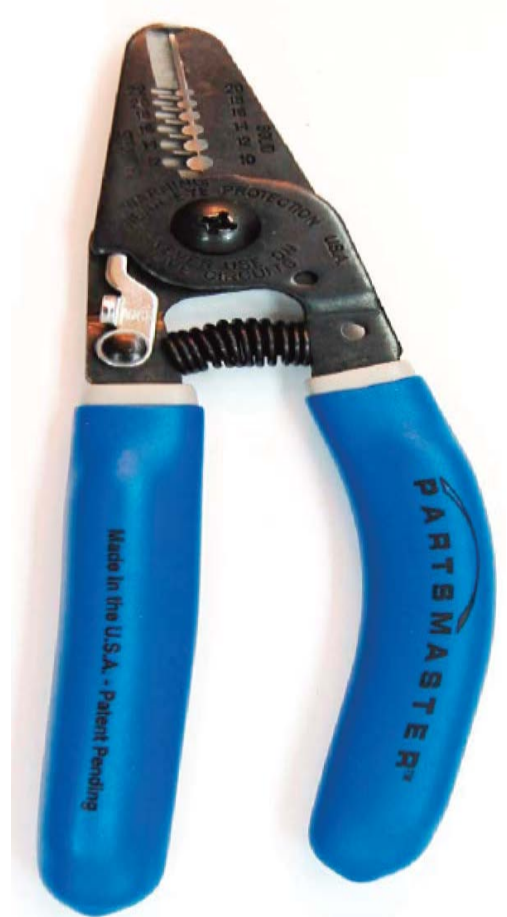
Ergo Safety Strip-Cut Plier #DY89310248