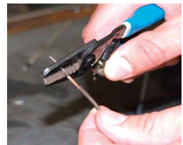
Strips stranded and solid copper and aluminum wire