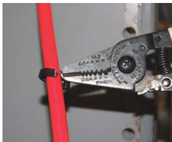
Cuts cable ties without damaging outer shield